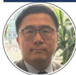
Thomas Lan Friedman LLP New York, USA