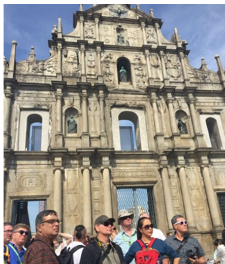
DFK Post Conference Tour to Macau