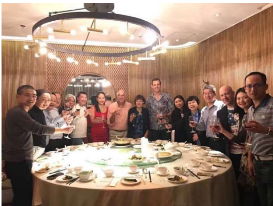
Peking CPAs hosted dinner