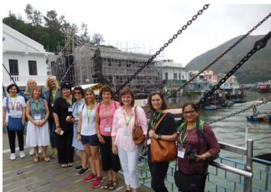
DFK Accompanying Persons' Tour to Tai O Fishing Village