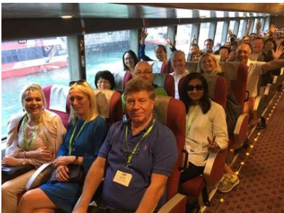
DFK Post Conference Tour to Macau