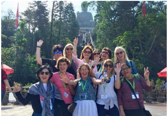
DFK Accompanying Persons' Tour to Lantau Island