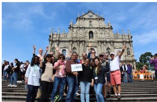
Post Conference Tour to Macau