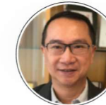
TC Ma Sino-bridge China Consulting Hong Kong, China