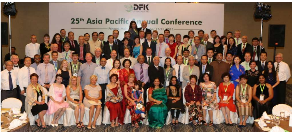
DFK Asia Pacific 25 th Anniversary Gala Dinner Group Photo